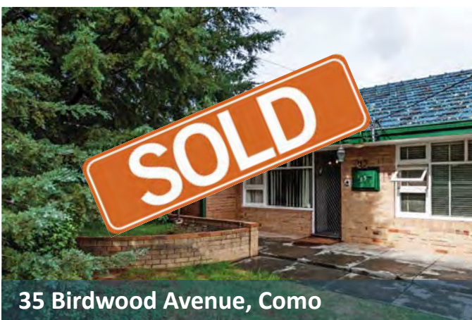
35 Birdwood Avenue, Como