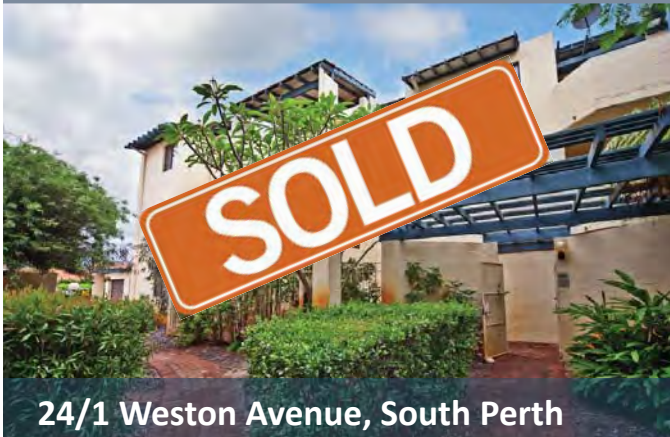
24/1 Weston Avenue, South Perth