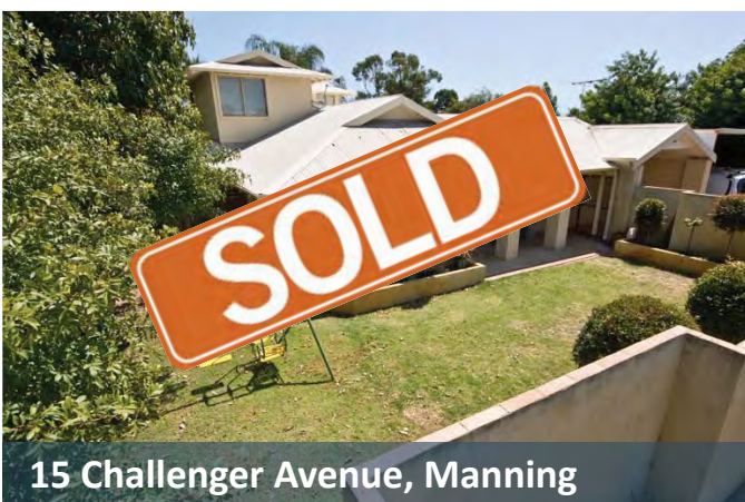
15 Challenger Avenue, Manning