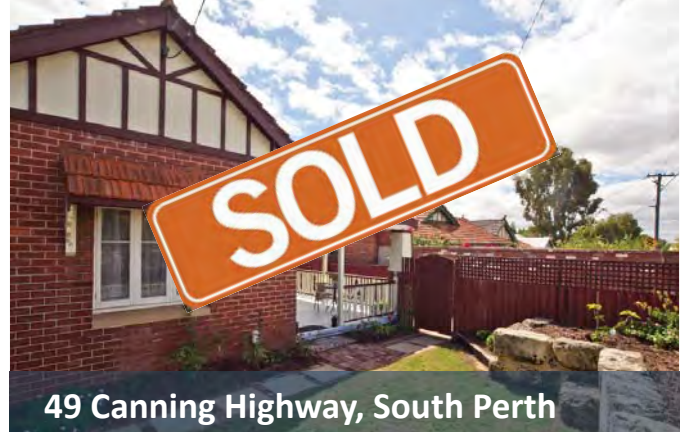
49 Canning Highway, South Perth