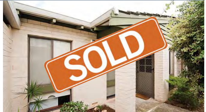
3/72 Robert Street, Como