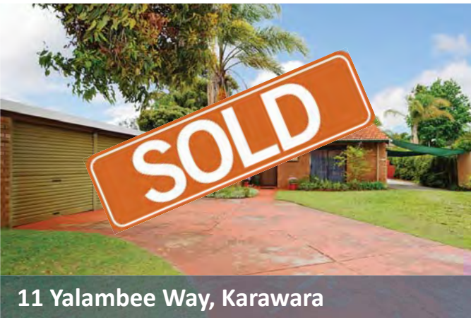
11 Yalabee Way, Karawara