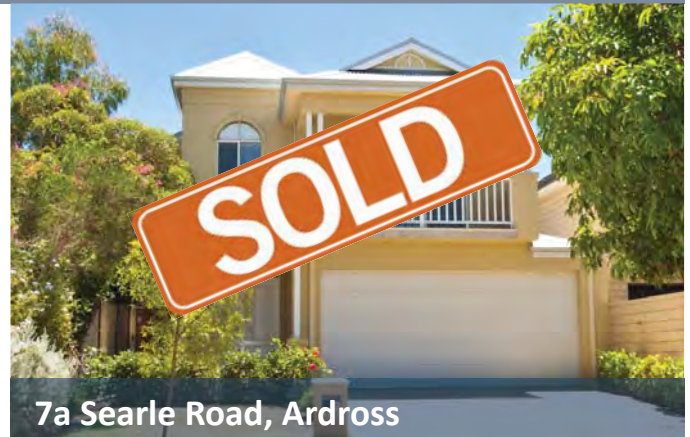
7a Searle Road, Ardress