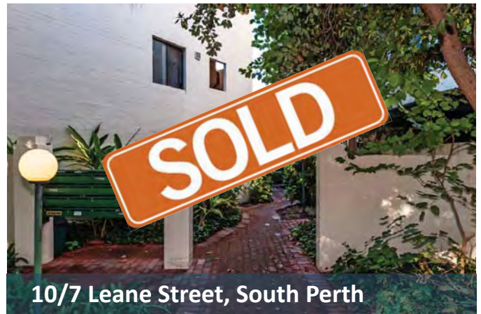
10/7 Leane Street, South Perth