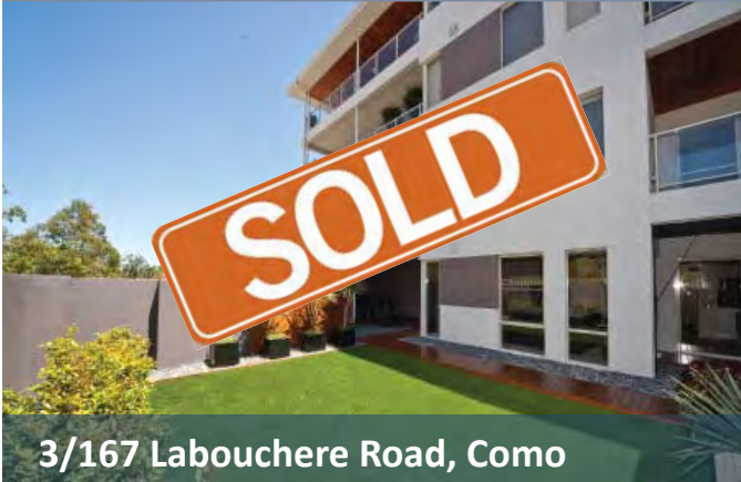
3/167 Labouchere Road, Como