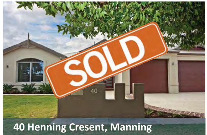
40 Henning Crescent, Manning