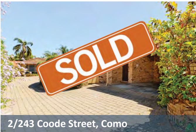
2/243 Coode Street, Como