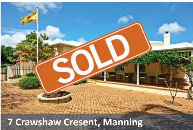
7 Crawshaw Cresent, Manning