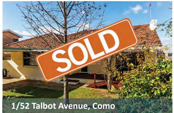
1/52 Talbot Avenue, Como