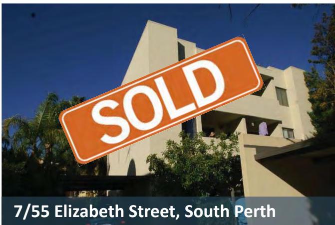
7/55 Elizabeth Street, South Perth