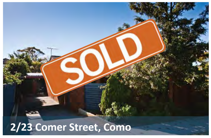
2/23 Comer Street, Como