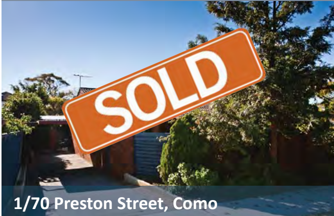
1/70 Preston Street, Como