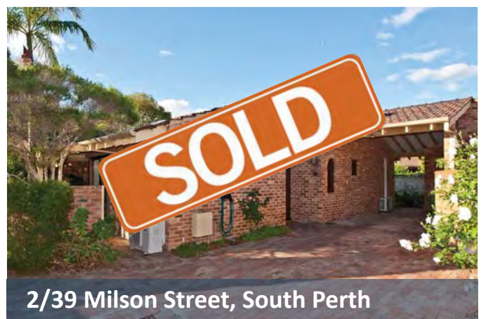
2/39 Milson Street, South Perth