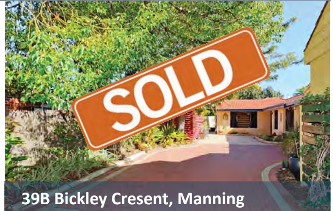
39B Bickley Cresnet, Manning