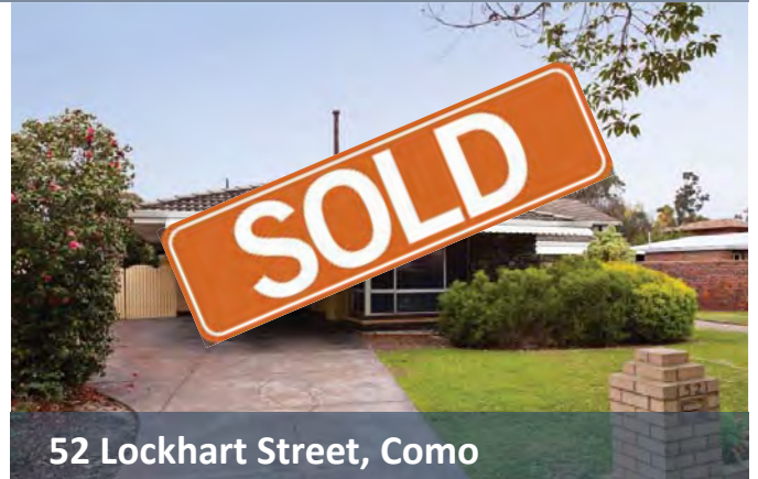
52 Lockhart Street, Como