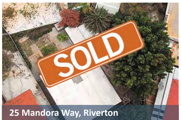
25 Mandora Way, Riverton