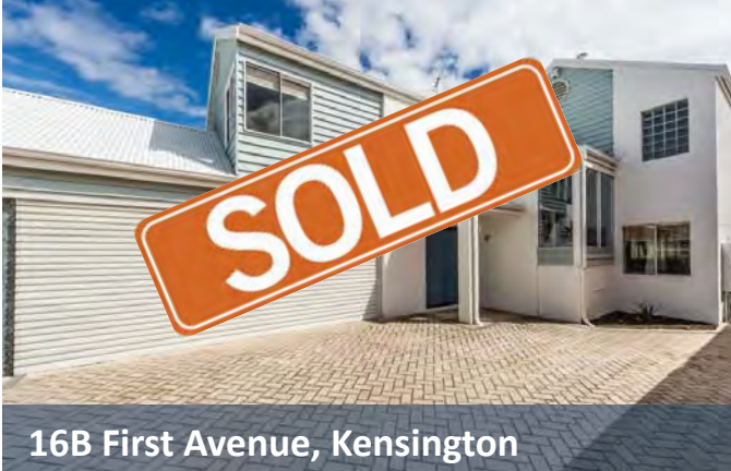
16B First Avenue, Kensington