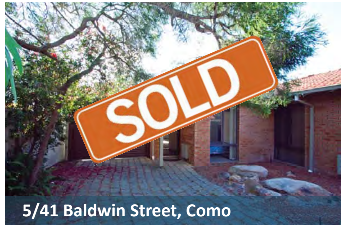
5/41 Baldwin Street, Como