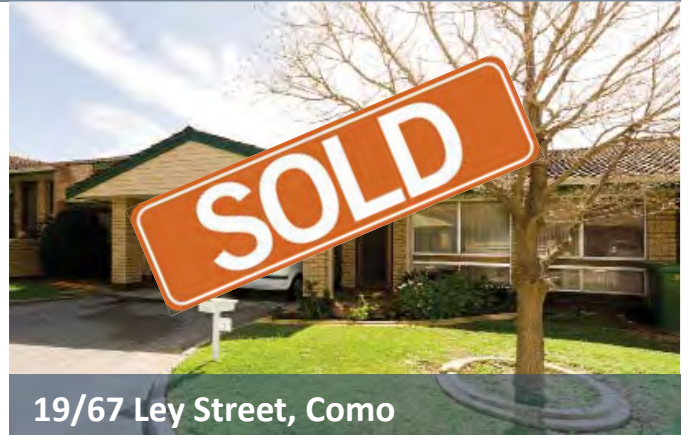
19/67 Ley Street, Como