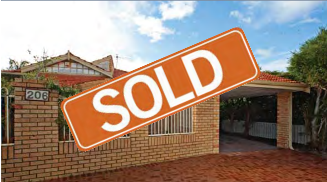
2/206 Melville Parade, Como