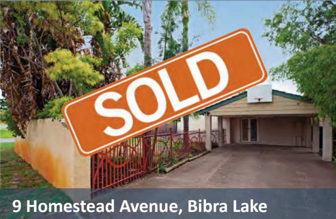
9 Homestead Avenue, Bibra Lake