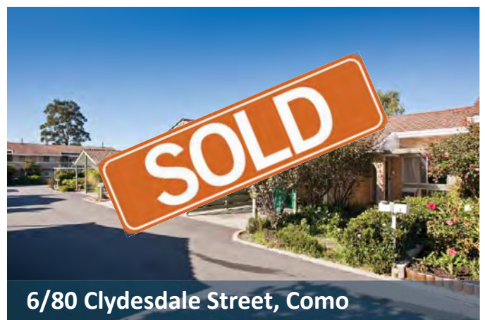
6/80 Clydesdale Street, Como