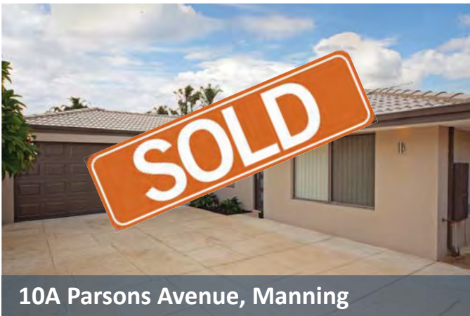
10A Parsons Avenue, Manning