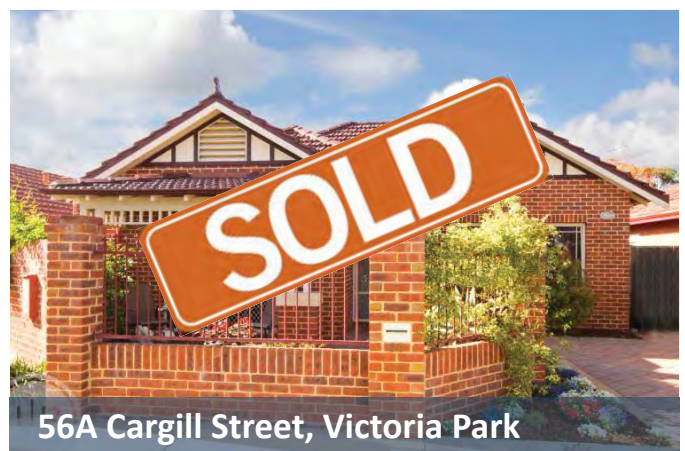
56A Cargill Street, Victoria Park