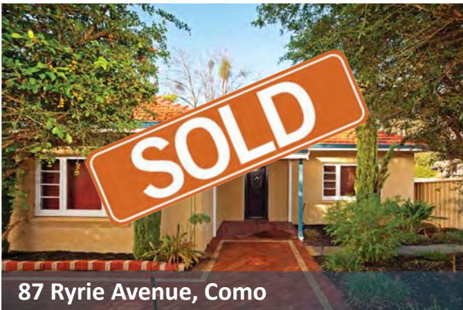
87 Ryrie Avenue, Como