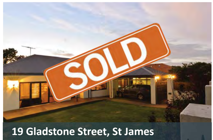
19 Gladstone Street, St James