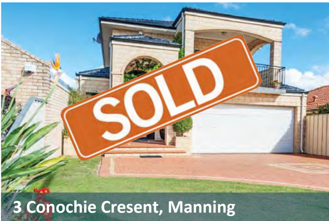
3 Conochie Crescent, Manning