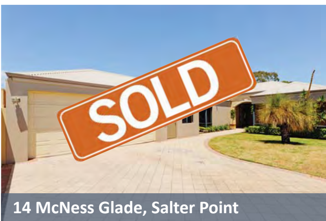
14 McNess Glade, Salter Point