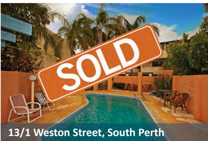
13/1 Weston Street, South Perth