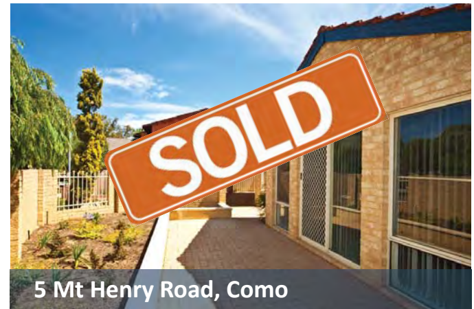
5 Mt Henry Road, Como