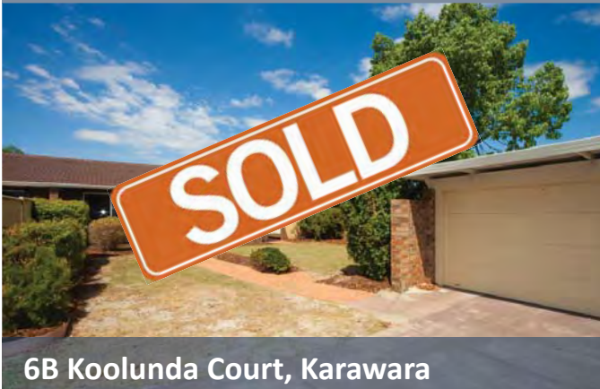
6B Koolunda Court, Karawara