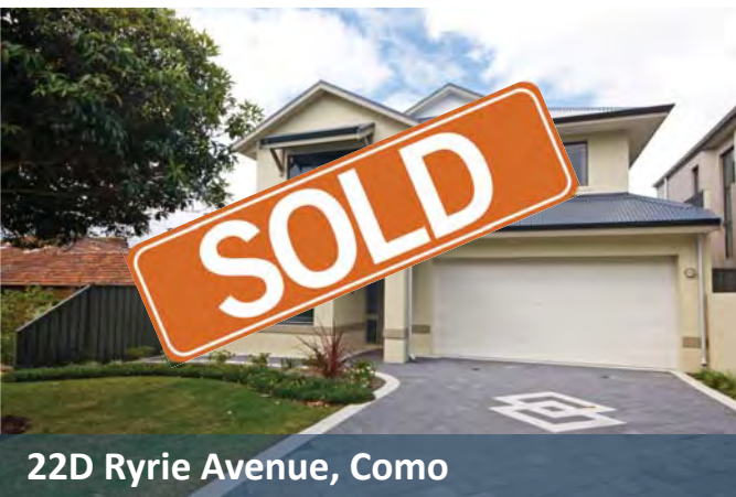
22D Ryrie Avenue, Como