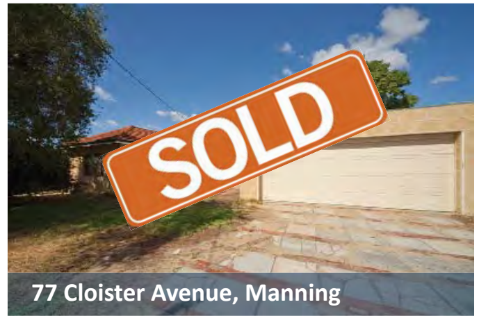
77 Cloister Avenue, Manning