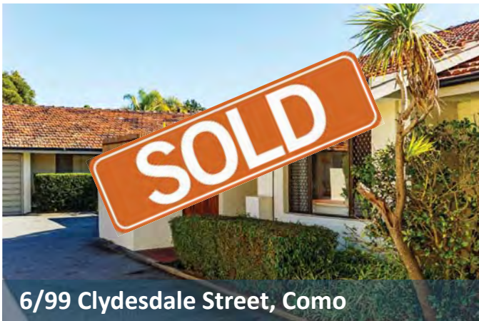
6/99 Clydesdale Street, Como