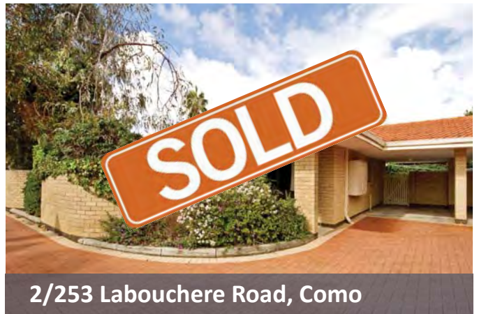
2/253 Labouchere Road, Como