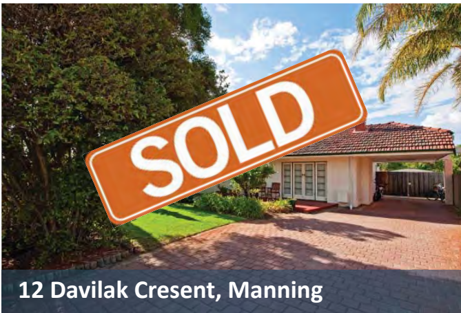
12 Davilak Cresent, Manning