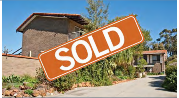
1/21 Lockhart Street, Como