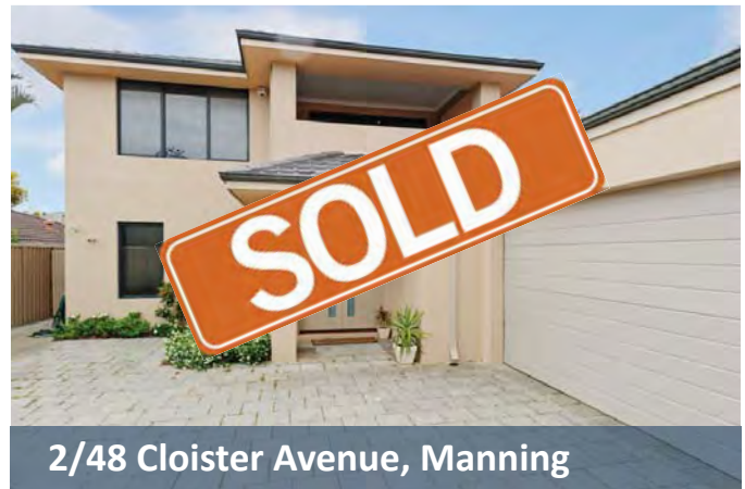
2/48 Cloister Avenue, Manning