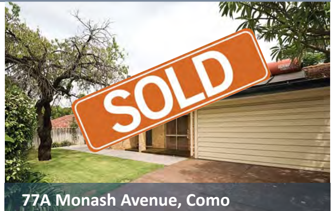
77A Monash Avenue, Como