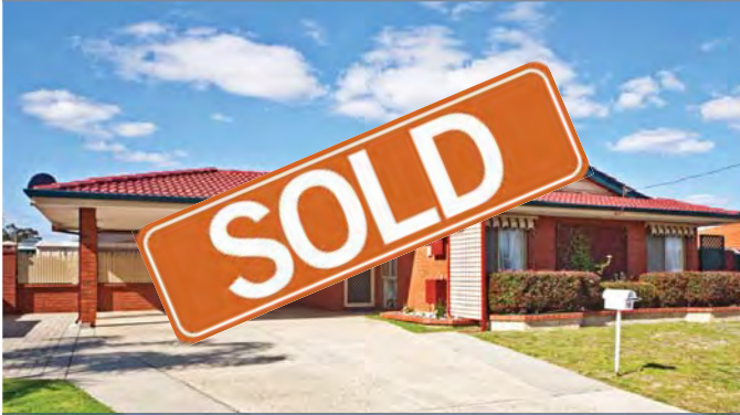
19 Choseley Street, Langford