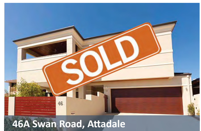
46A Swan Road, Attadale