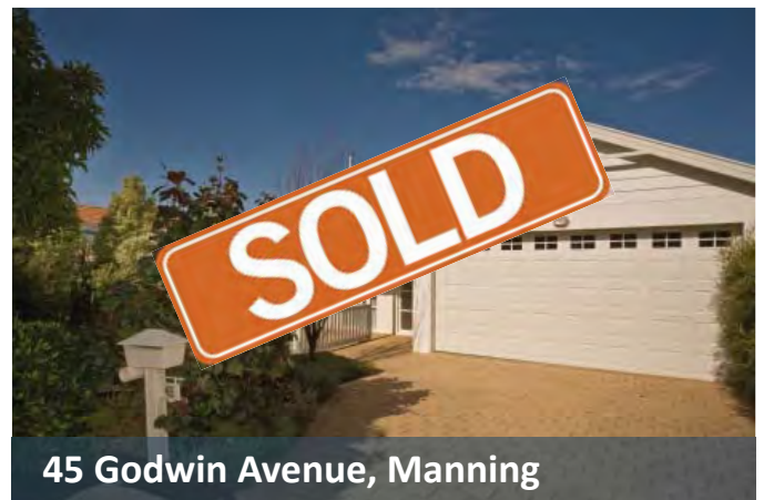
45 Godwin Avenue, Manning