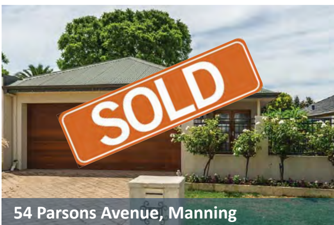
54 Parsons Avenue, Manning