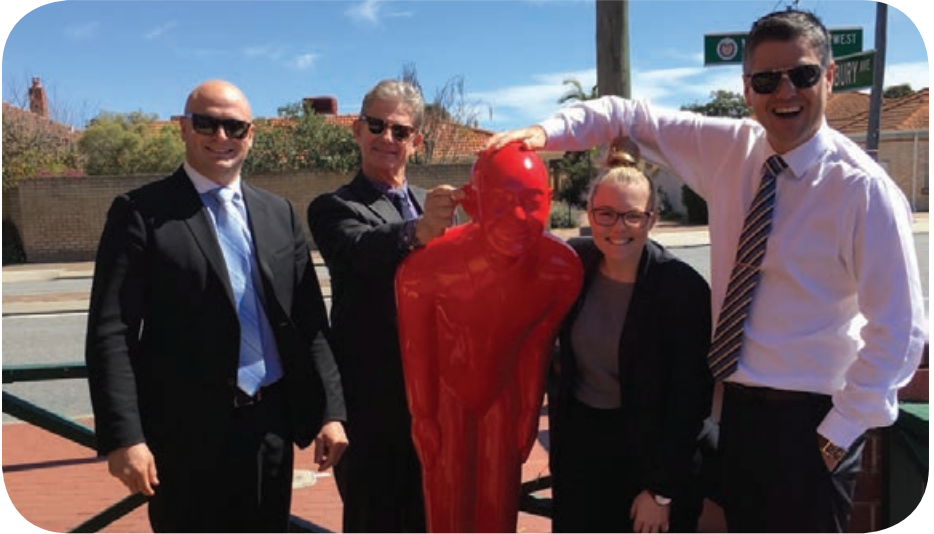
A sunny day, out for a coffee at Redman Café.