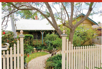
5 Briggs St, Bassendean