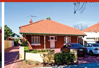
168 Central Ave, Inglewood