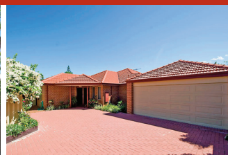
168a Shaftesbury Ave, Bedford