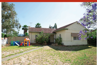
51 Birkett St, Bedford