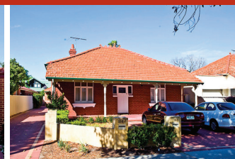
168 Central Ave, Inglewood