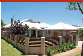
138 Wood St, Inglewood