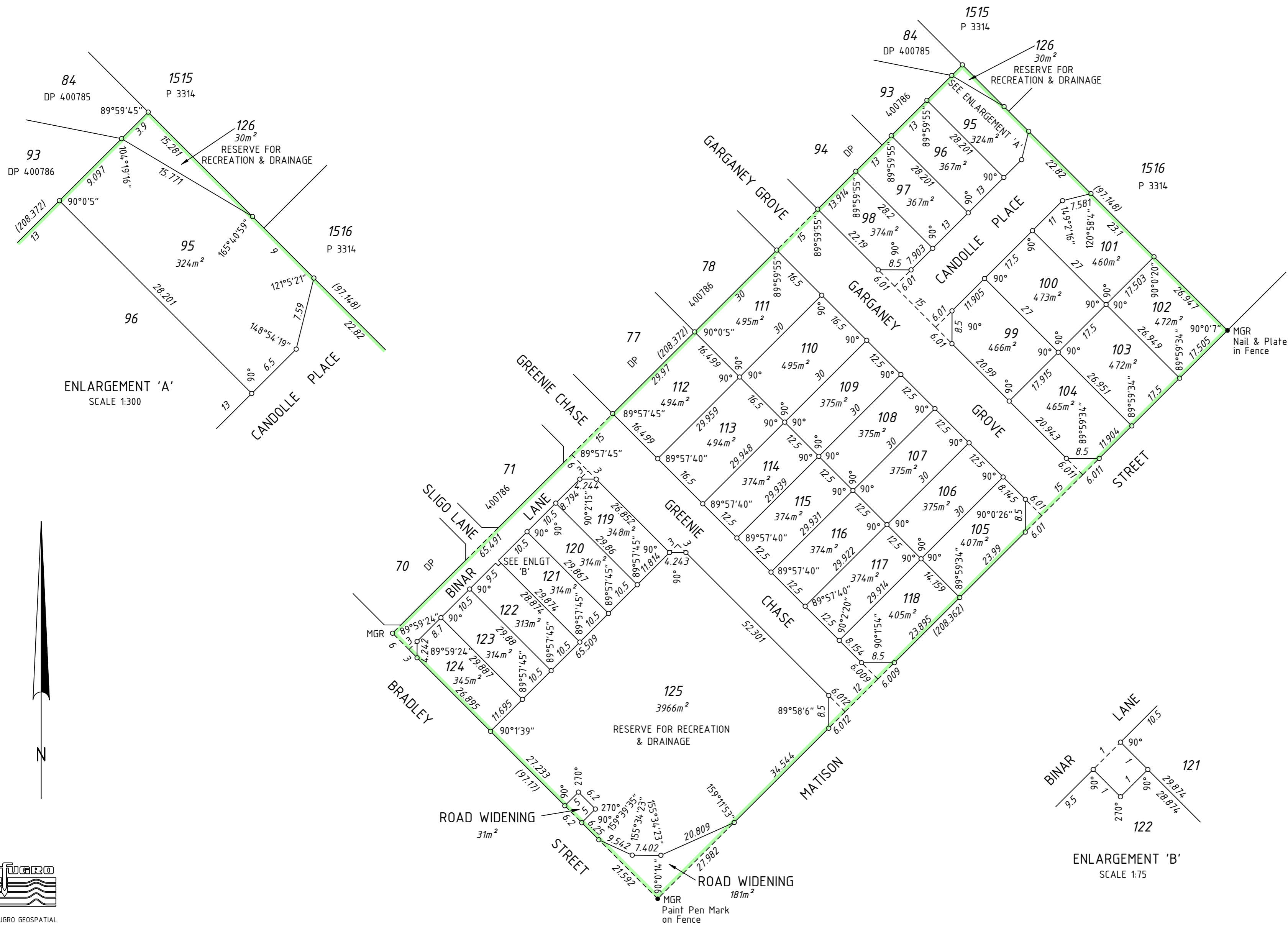
ENLARGEMENT 'A' SCALE 1:300

SURVEY CARRIED OUT UNDER REGULATION 26A SPECIAL SURVEY AREA GUIDELINES SEE SURVEY SHEET(S) FOR SURVEY INFORMATION